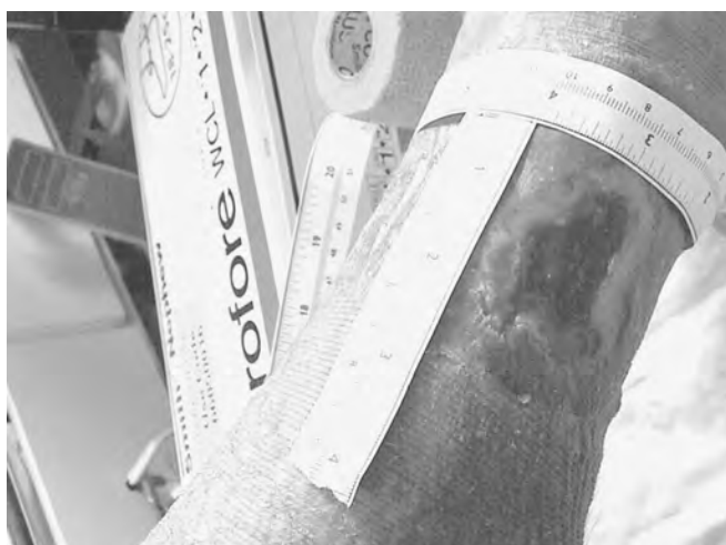
25 October 2002

Chronic venous leg ulcer management is frequently