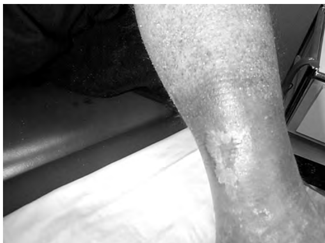
22 November 2002

complicated by the need to manage exudate and protect the peri-ulcer skin from maceration. The excessive amount of haemoserous exudate combined with poor exudate control was resolved with an alginate, and hydrocellular foam dressing which prevented deterioration of the ulcer. As the ulcer failed to progress referral to an ulcer clinic was warranted for further vascular review. Accurate assessment and diagnosis of a venous leg ulcer at the ulcer clinic permitted the application of the four-layer compression bandage.