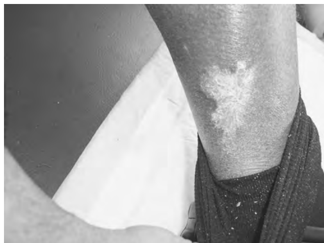
8 August 2003

Compression therapy was the appropriate treatment in this